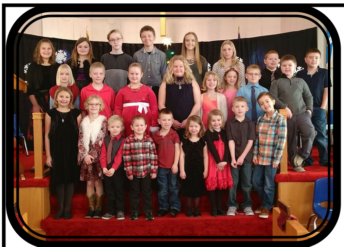
Faith Sunday School ~ 2018 Christmas Program